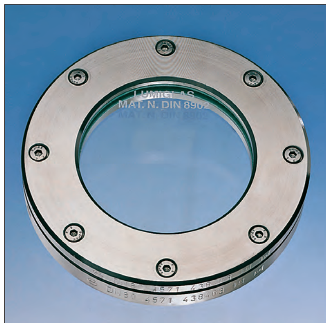
Circular sight glass fitting in stainless steel

After welding in the base flange (1) into the vessel wall, gaskets (2), glass sight glass disc (3) and cover flange (4) are carefully laid and bolted together with bolts (5). Tighten progressively on a diametric cross basis with socket spanner.