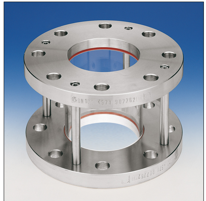
Lumiglas tubular sightglass/flow indicator