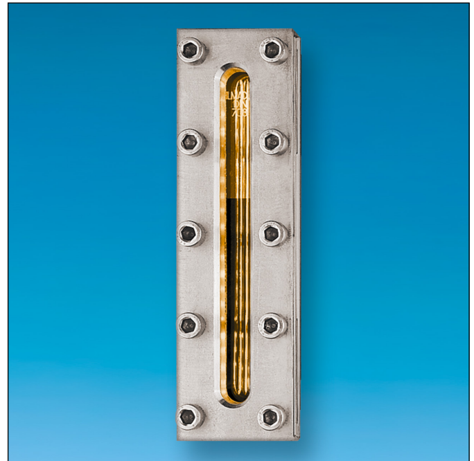
Complete assembly of a Lumiglas sight glass fitting rectangular

Progressively and carefully tighten down cover flange commencing with bolts in middle of flange and working outwards in crosswise alternating sequence (refer to sequence numbers 1-14 in illustration).