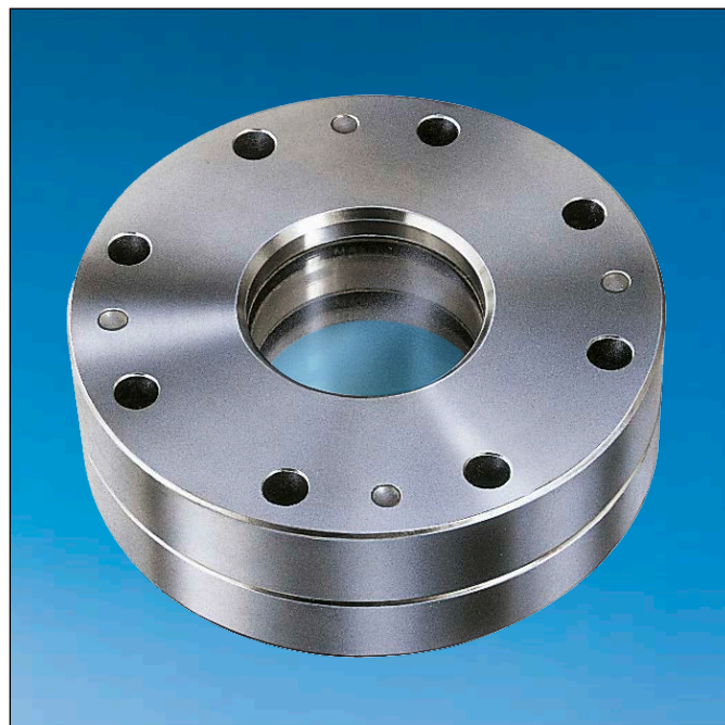
Lumiglas double glass safety sight glass fitting